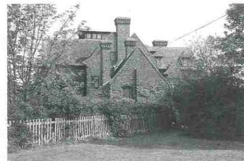
"Arts and Crafts" style