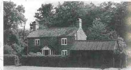
Typical Forest cottage