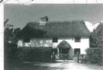
"Burley Rock" cottage