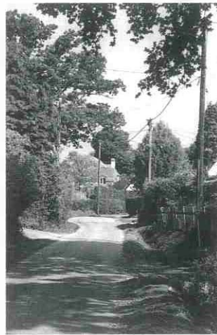
Coach Hill Lane

These are key features in the conservation area and the points relate to the numbered areas on the map: