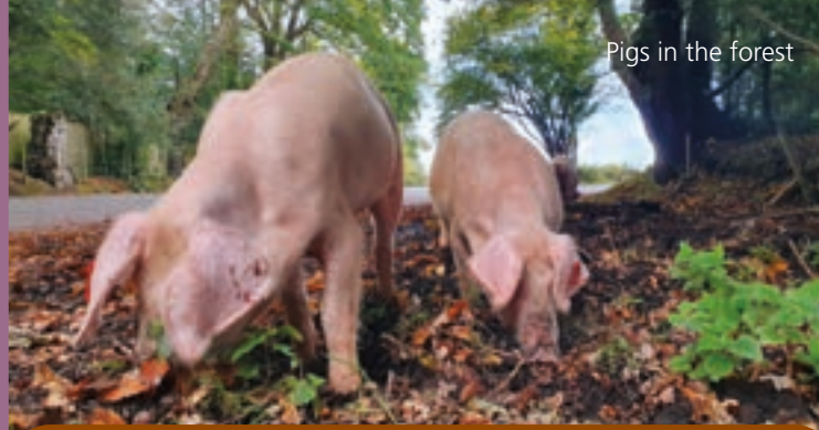
Pigs in the forest

Indeed William the Conqueror, who set aside the 'New Forest' for hunting more than 900 years ago, would probably recognise much of it today.