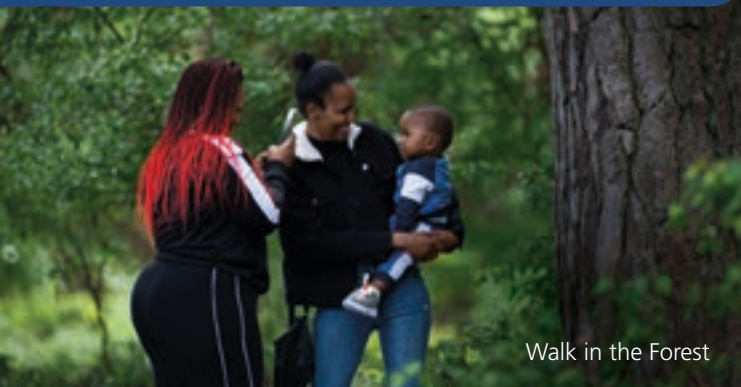
Walk in the Forest

Ticks: Check your dog and yourself for ticks when you get home – they can cause Lyme Disease.