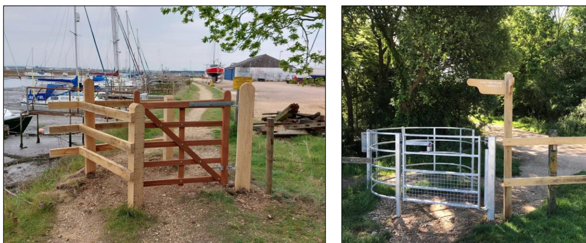
Fig. 2- Photograph showing newly installed wooden kissing gate and sign next to accessible kissing gate.