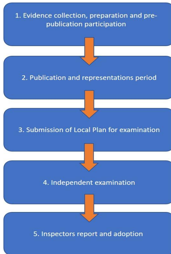
Figure 3: Local plan preparation