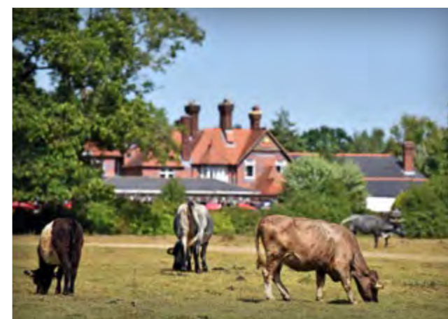
The landscape setting of Ashurst, showing cattle grazing to the south west of the village