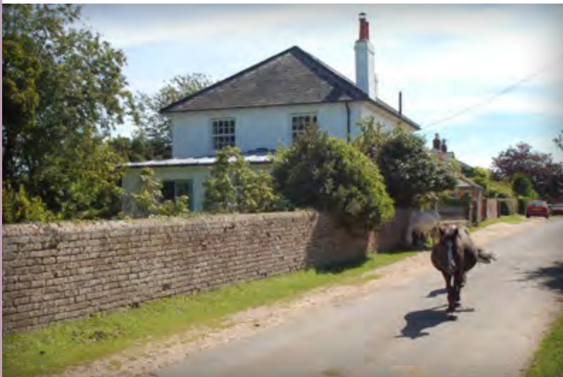
A typical low brick wall boundary behind a soft grass verge