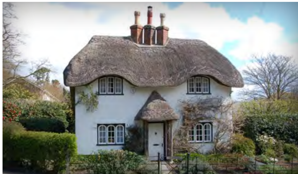
A traditional cottage garden with a variety of plants, shrubs, and climbers