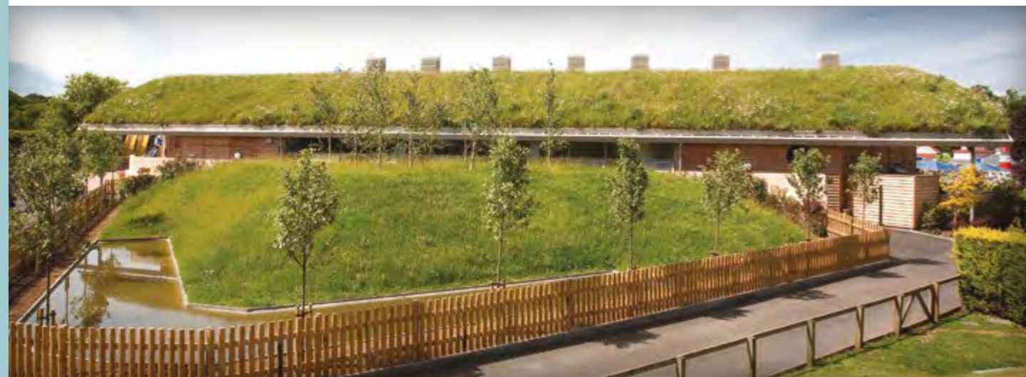
The successful use of a green roof at Paultons Park theme park