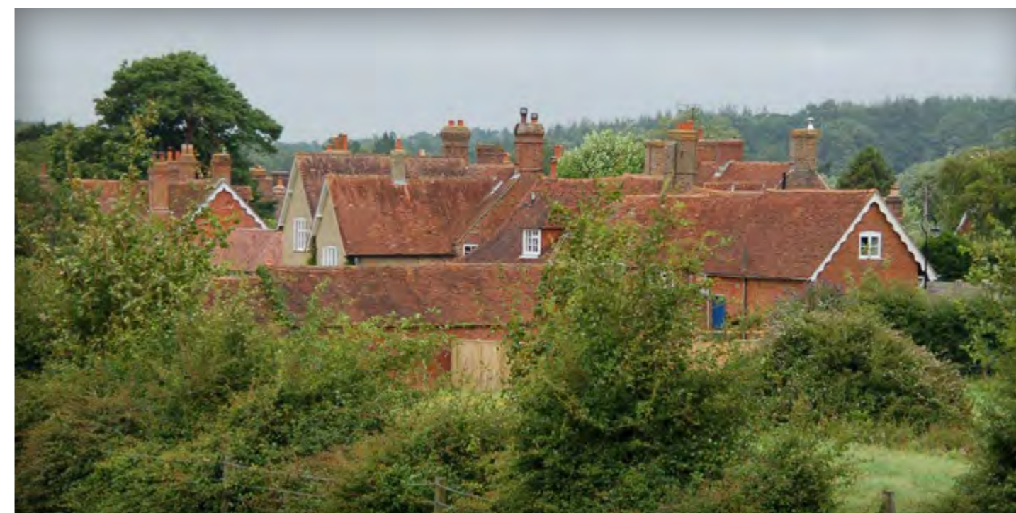
The rhythm of clay roof tiles, chimneys and steeply pitched roofs in Beaulieu