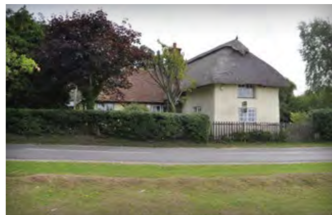
A cob encroachment cottage on the edge of the Open Forest that has been extended as it has become established