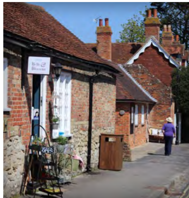
Successful low-key signage in Beaulieu High Street

that is larger than 0.3 square metres, or for illuminated signs of any size on the front of, or outside their property.