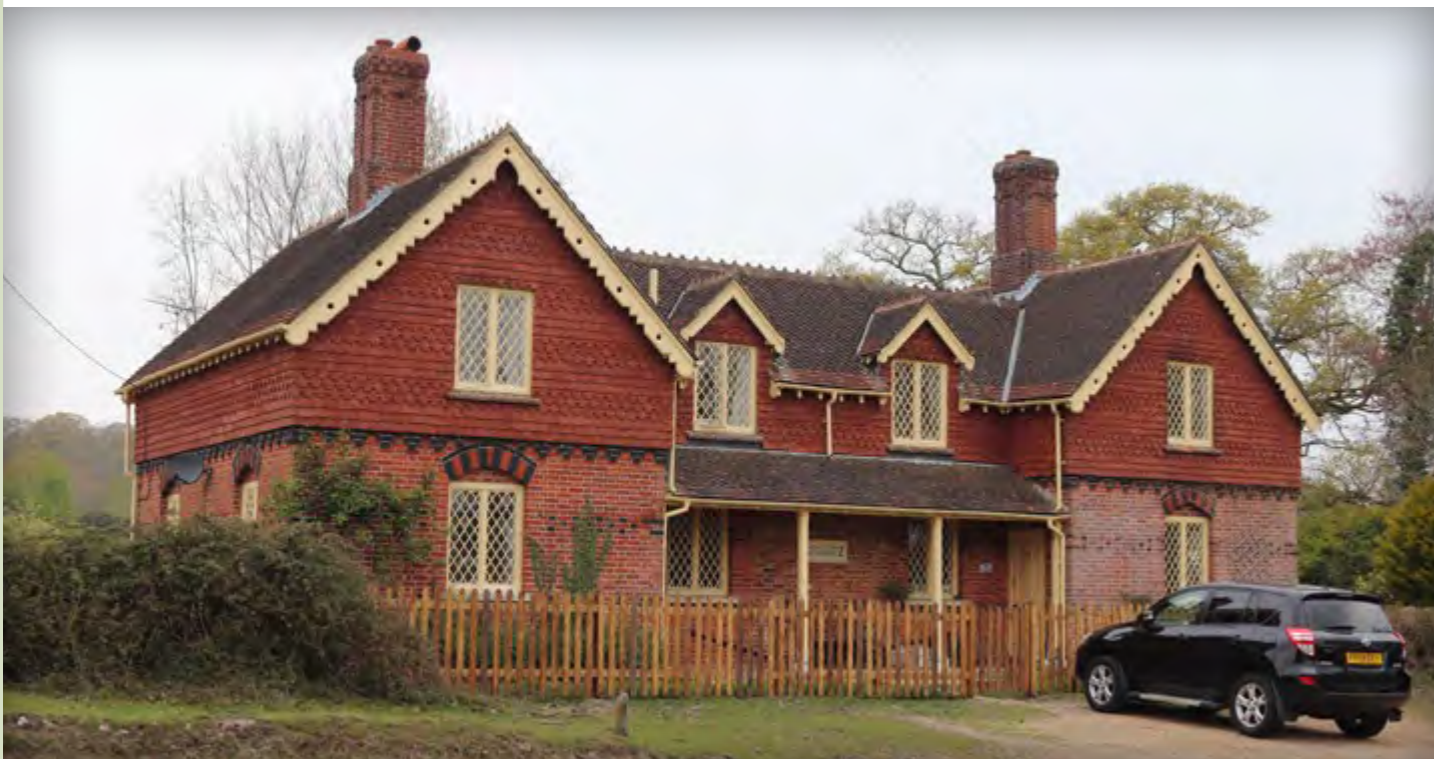
A pair of estate cottages in Bramshaw displaying decorative architectural features indicative of their status

have not survived, though some of their 18th and 19th century replacements do. These country houses were at the forefront of architectural fashion and innovation, often displaying the influences of continental architecture. The supporting infrastructure to the large houses (the gate houses, estate cottages, lodges, model farms and dairies etc.), though usually modest in size, also often had formal architectural tropes, distinct to each estate, as seen at Breamore (just outside