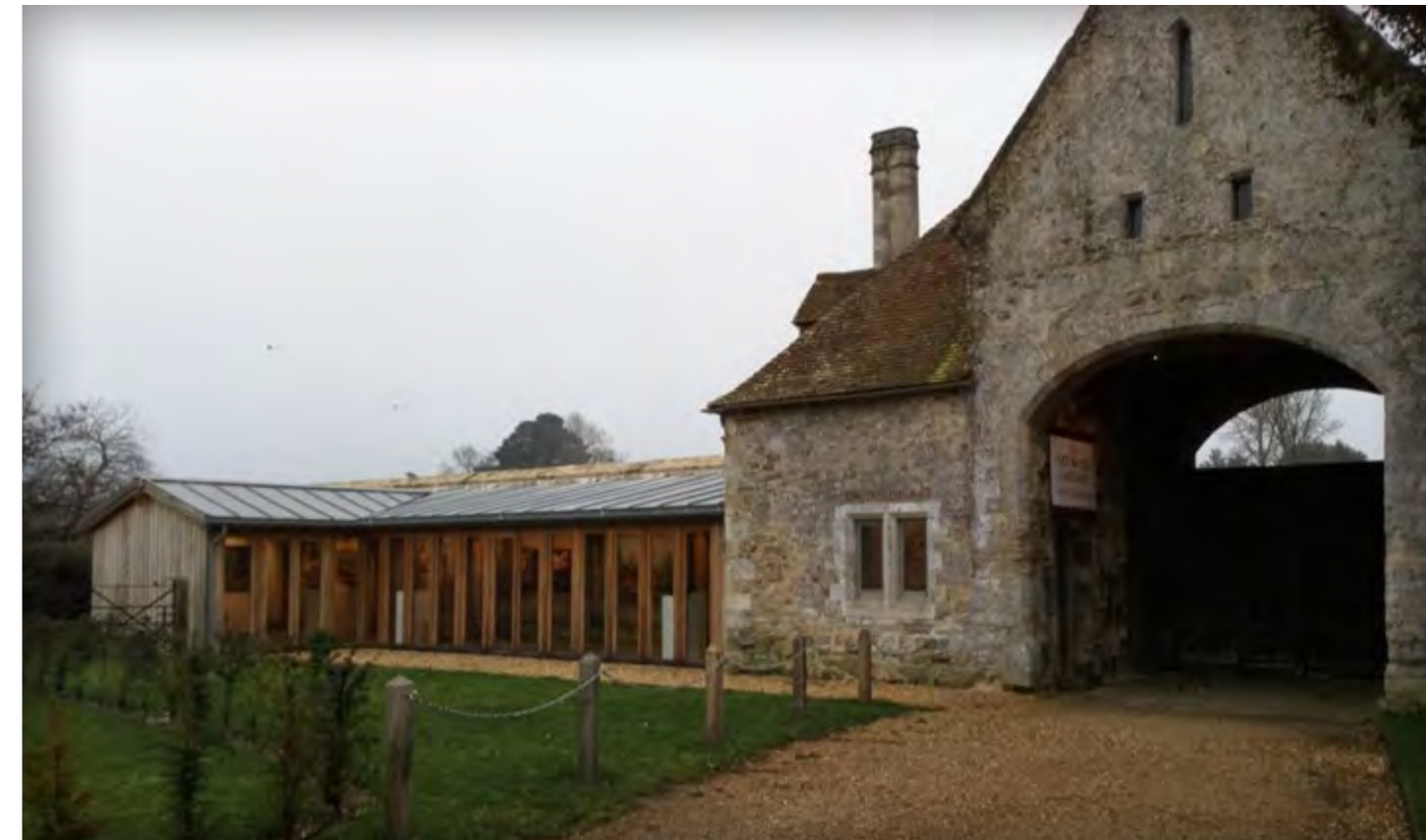
New modern, sympathetically designed gallery adjacent to the historic Beaulieu Gate House - Building Design Award winner 2020