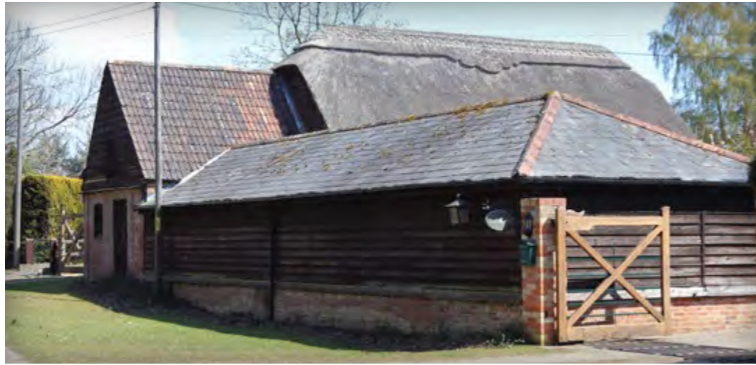
Traditional weatherboarding and roofing materials on agricultural buildings in Burley