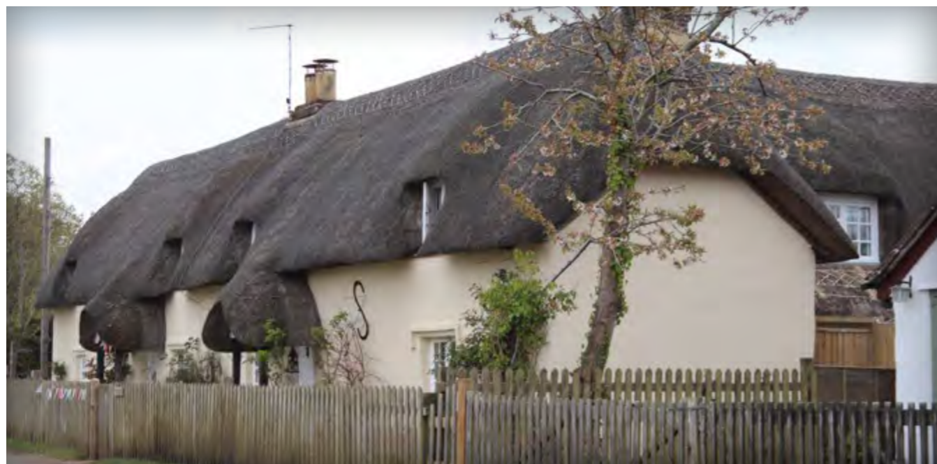
A pair of lime plastered cob cottages under a thatched roof with a traditional simple flush ridge in Hale