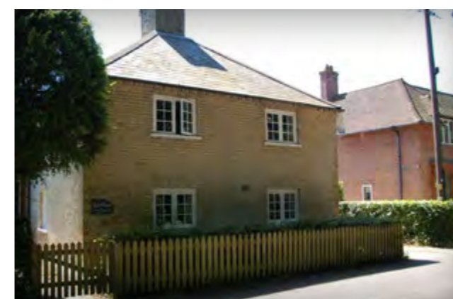
Buff brick and plum brick dwellings sitting side by side, Exbury