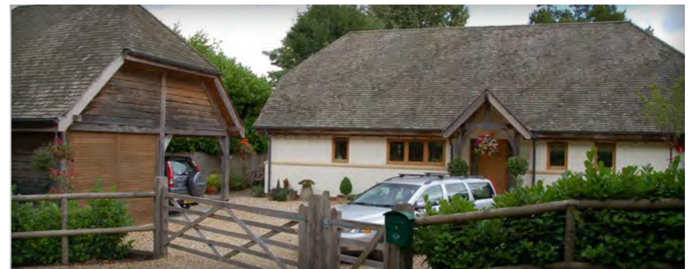
A shingle roof on a new build cottage in Burley