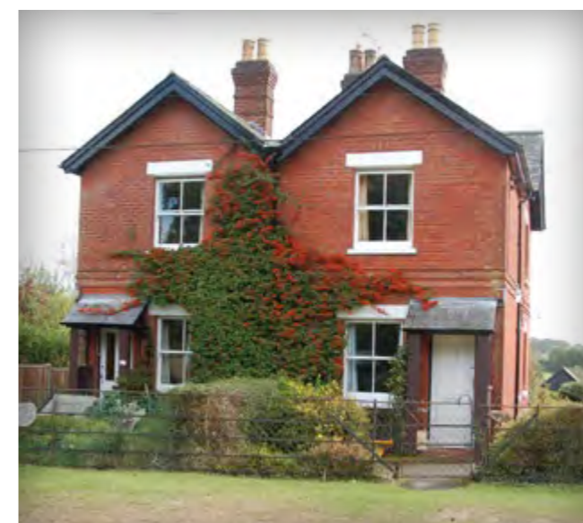
Traditionally proportioned pair of semi-detached cottages, Fritham

relevant today. The quality of buildings can also be measured in their soundness of construction, method of heating, insulation, and adequate light and natural ventilation;