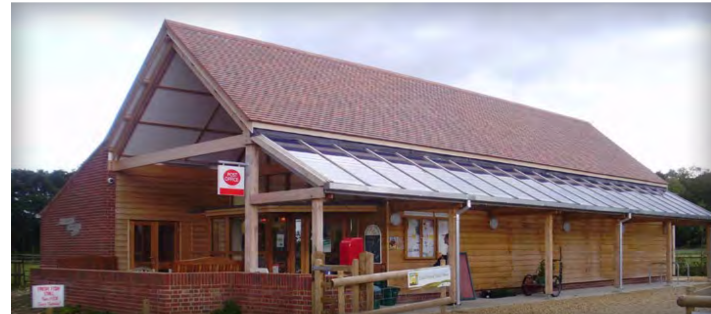
Woodgreen Community Shop with integral solar panels on the south-facing canopy