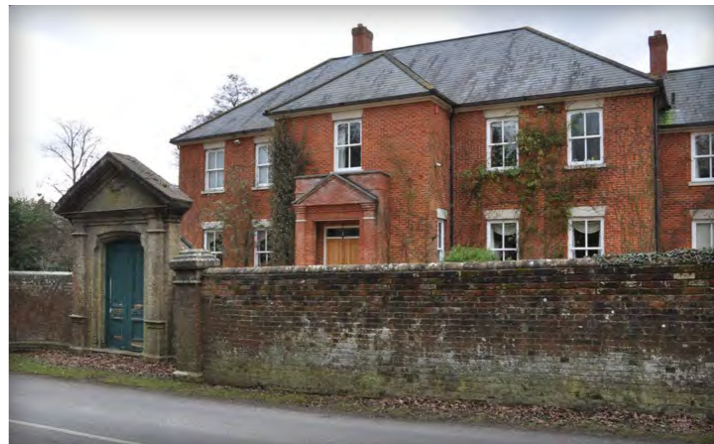
An example of a locally listed small country house built in a formal architectural style, with a grandiose pedimented gateway, Bramshaw

listed buildings, which the National Park Authority considers to have significance meriting consideration in planning decisions. The locally listed buildings identified to date are predominantly located within Conservation Areas, and have been compiled into a list by parish, which is available on our website www.newforestnpa.gov.uk . The 'Local List' will continue to evolve and as an ongoing process with further buildings across all areas of the National Park will be considered for inclusion. Policies SP16 and DP35 of the adopted National Park Local Plan (2019) seek to conserve the local distinctiveness of the area and safeguard locally listed buildings from inappropriate development, loss, or replacement.