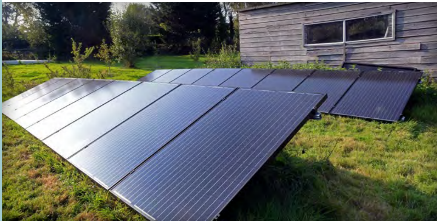
Ground mounted solar panels at Efford Mill

harming their character, and therefore alternative renewable technologies should be explored.