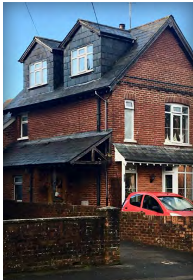
The large dormers feature wide cheeks, which appear heavy and out of proportion with the scale of the cottage

Cottages at Beaulieu with small roof dormers and discrete rooflights