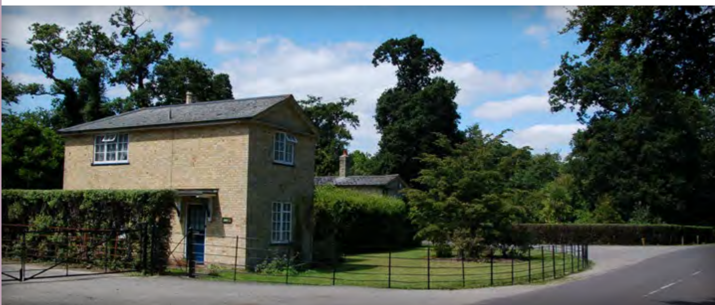
Traditional estate railings around the Exbury Estate lodges