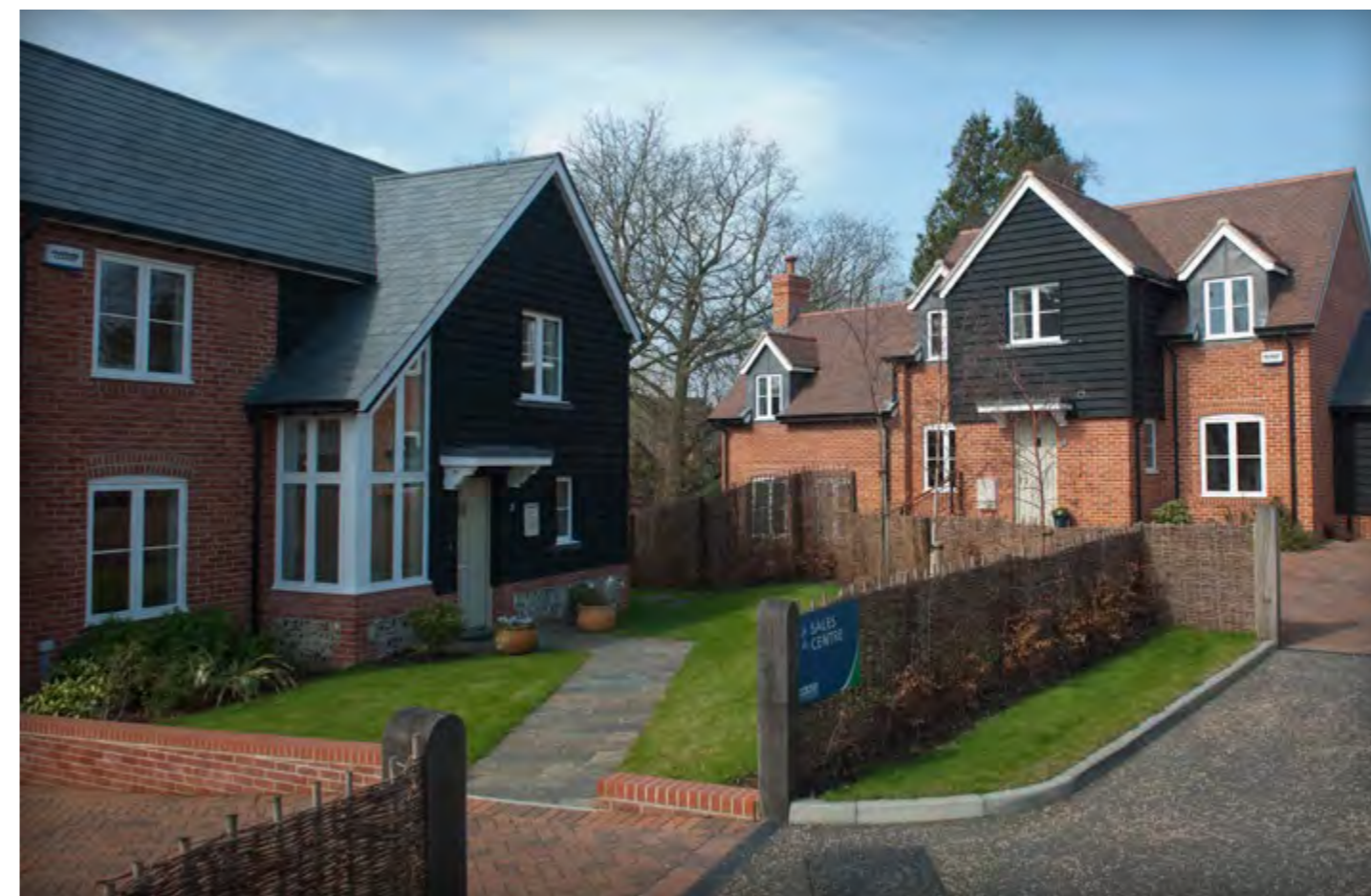
Housing development at Sway