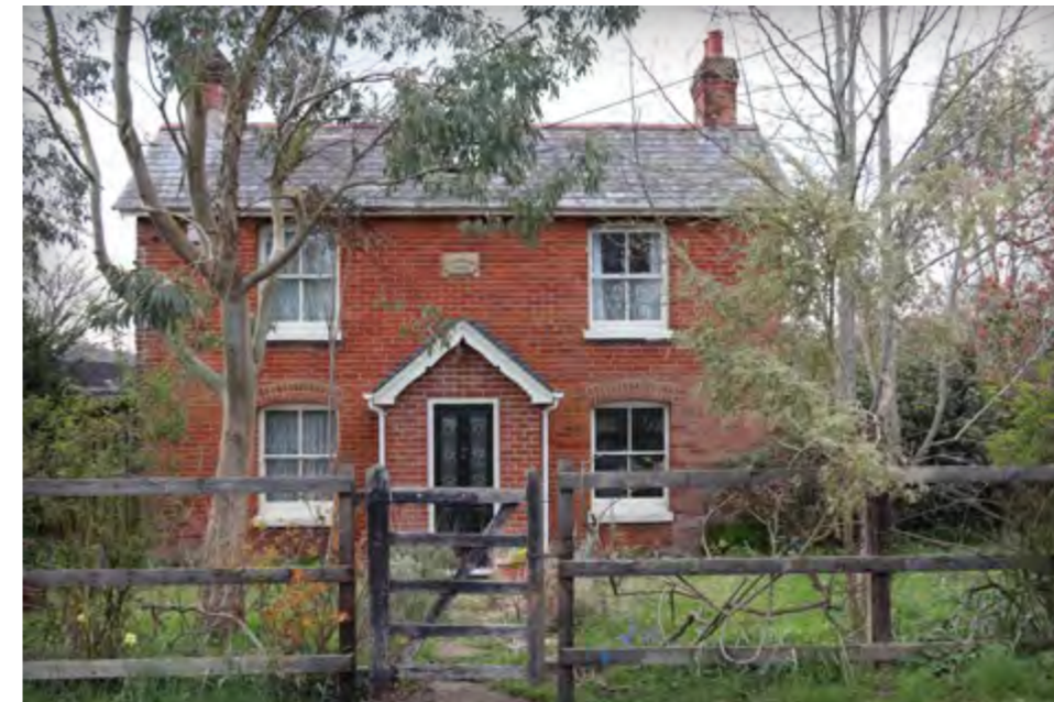
A typical 19th century New Forest Cottage behind a traditional timber post and rail fence and pedestrian gate