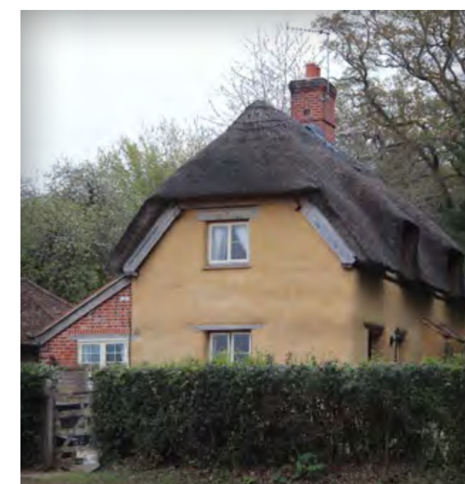
A cottage in Woodgreen rebuilt in cob after fire damage