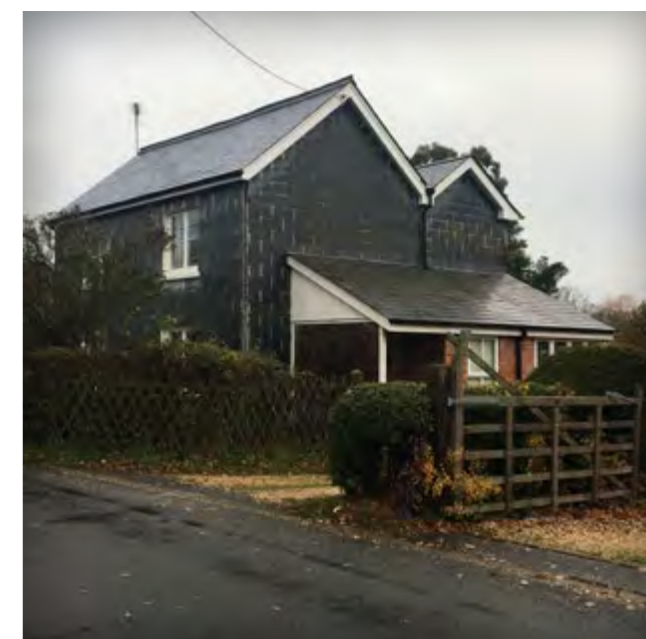
Side and rear extension subservient to the original cottage, Bartley