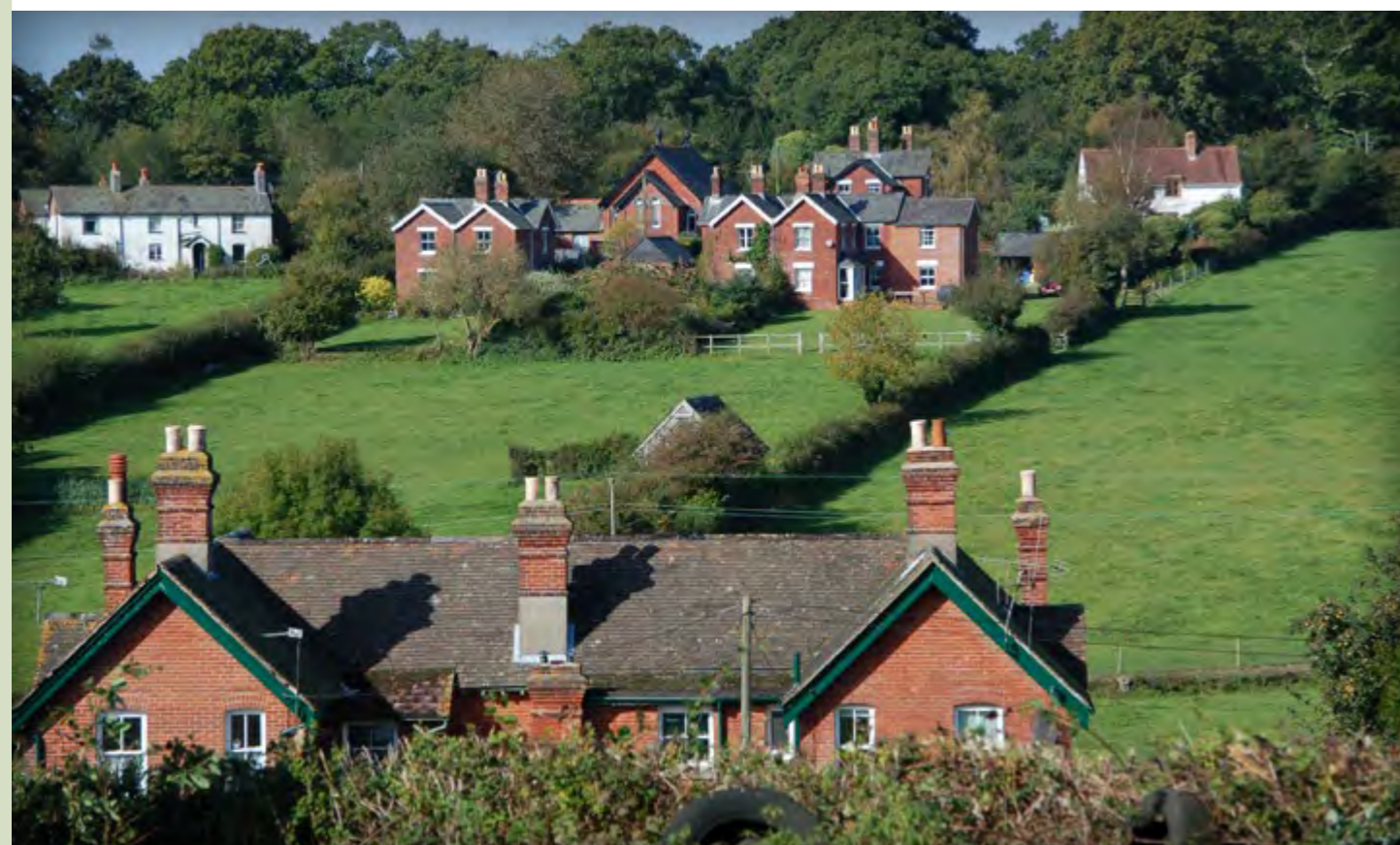
Historic development in Fritham nestling into the contours of the landscape