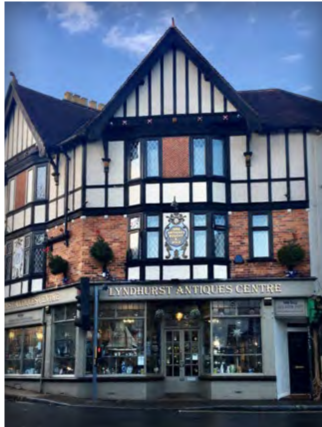
A traditionally proportioned shop front in Lyndhurst with minimal lighting and appropriate signage

discreetly located with the minimum number of lights to adequately light the fascia and will require consent. External lights should point downwards and be limited in number to protect the tranquility of the Forest. Further guidance is provided in Chapter 7.