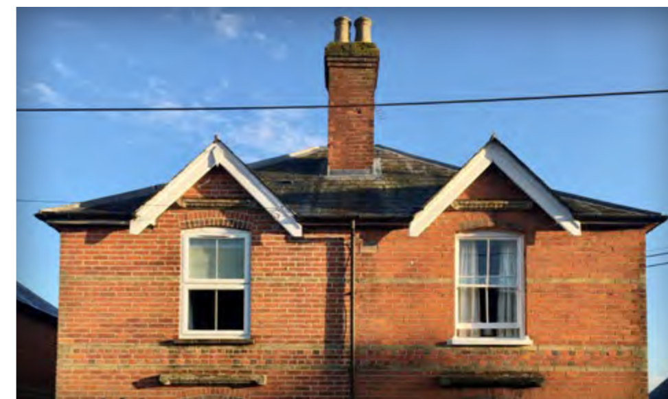
A pair of cottages showing the difference in frame size, finesse and detailing between UPVC and timber frames