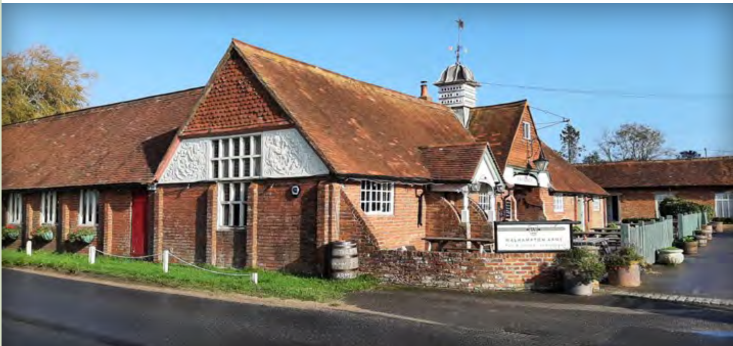
An example of a model farm with the buildings arranged around a courtyard, with ornate decorative pargeting, at Walhampton

the National Park), Pylewell or Exbury. Despite this, the estates have retained their rural landscape setting and character, as they were usually planned to provide a spacious aesthetic, a rural idyll.