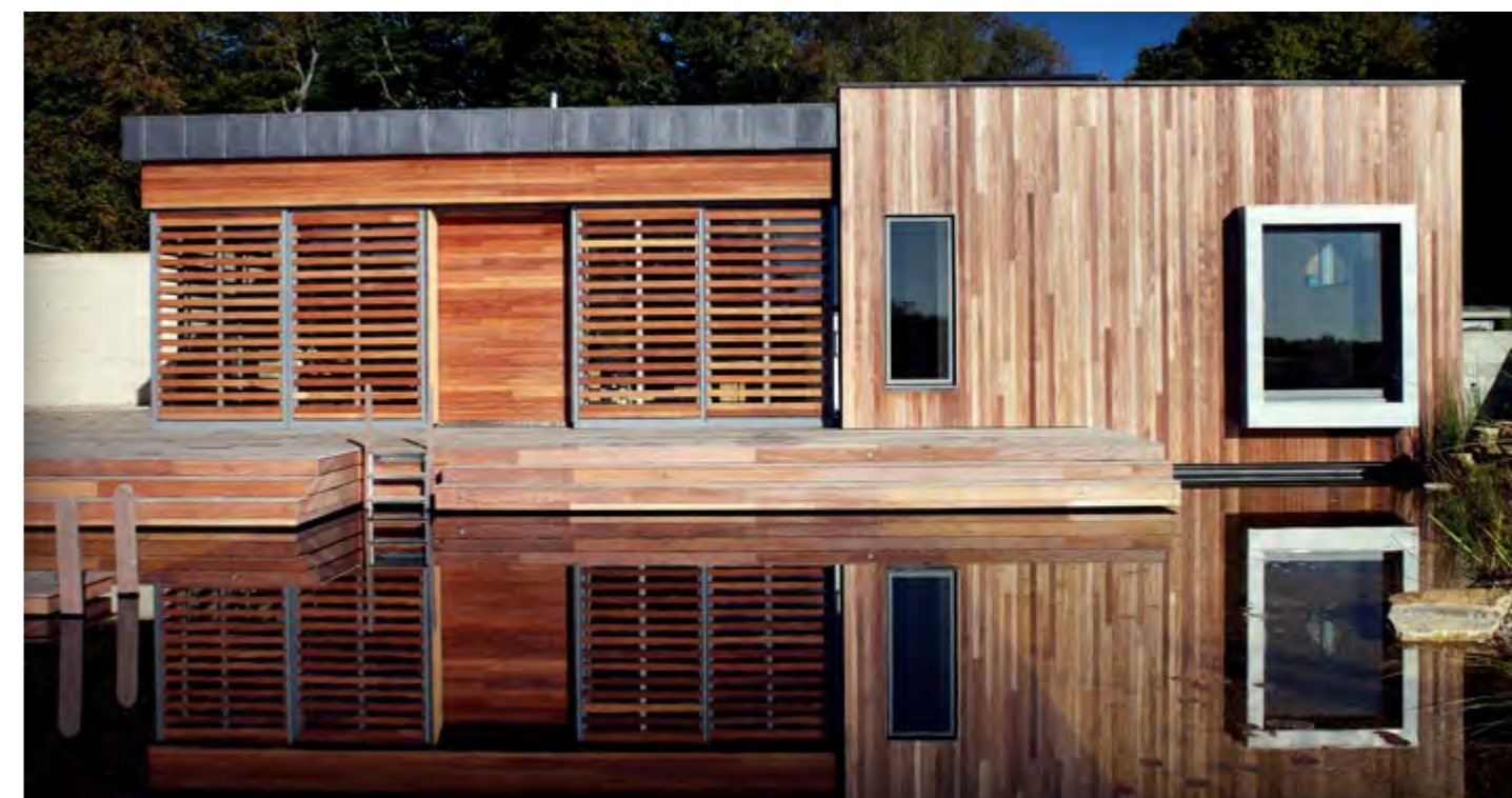
Effective use of louvres on this contemporary design to provide shading and reduce the impact of light spill from the large windows. Architects - PAD Studios