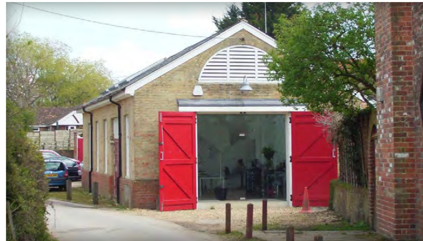
The successful conversion of the former Fire Station at Beaulieu into a design studio, which has retained the simple robust form and utilised existing openings