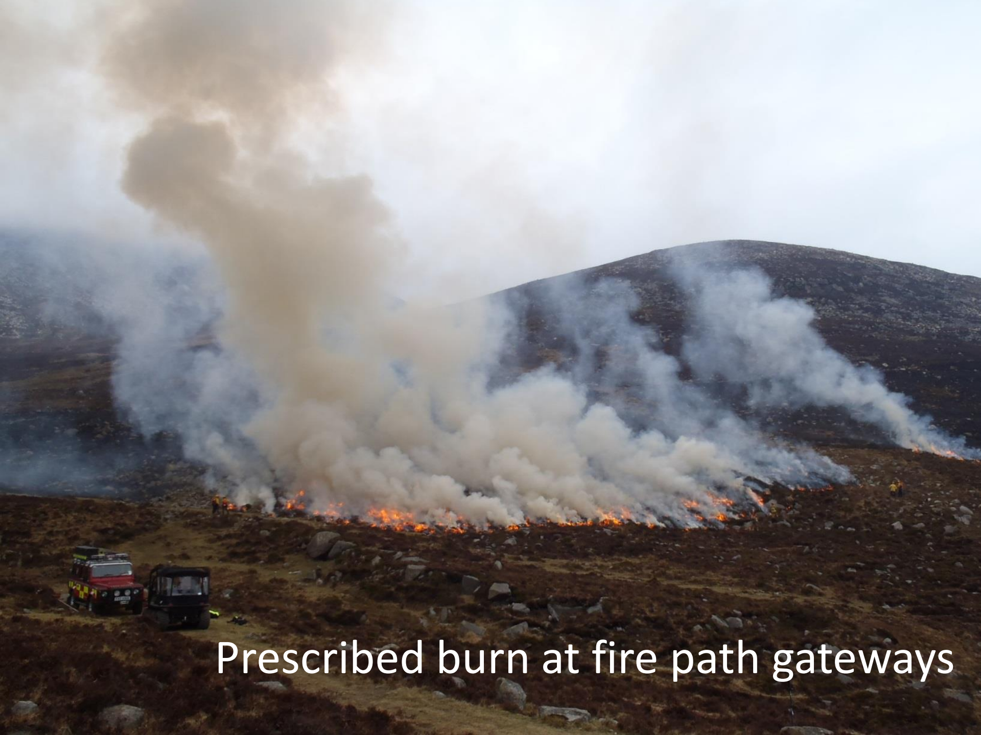
Prescribed burn at fire path gateways