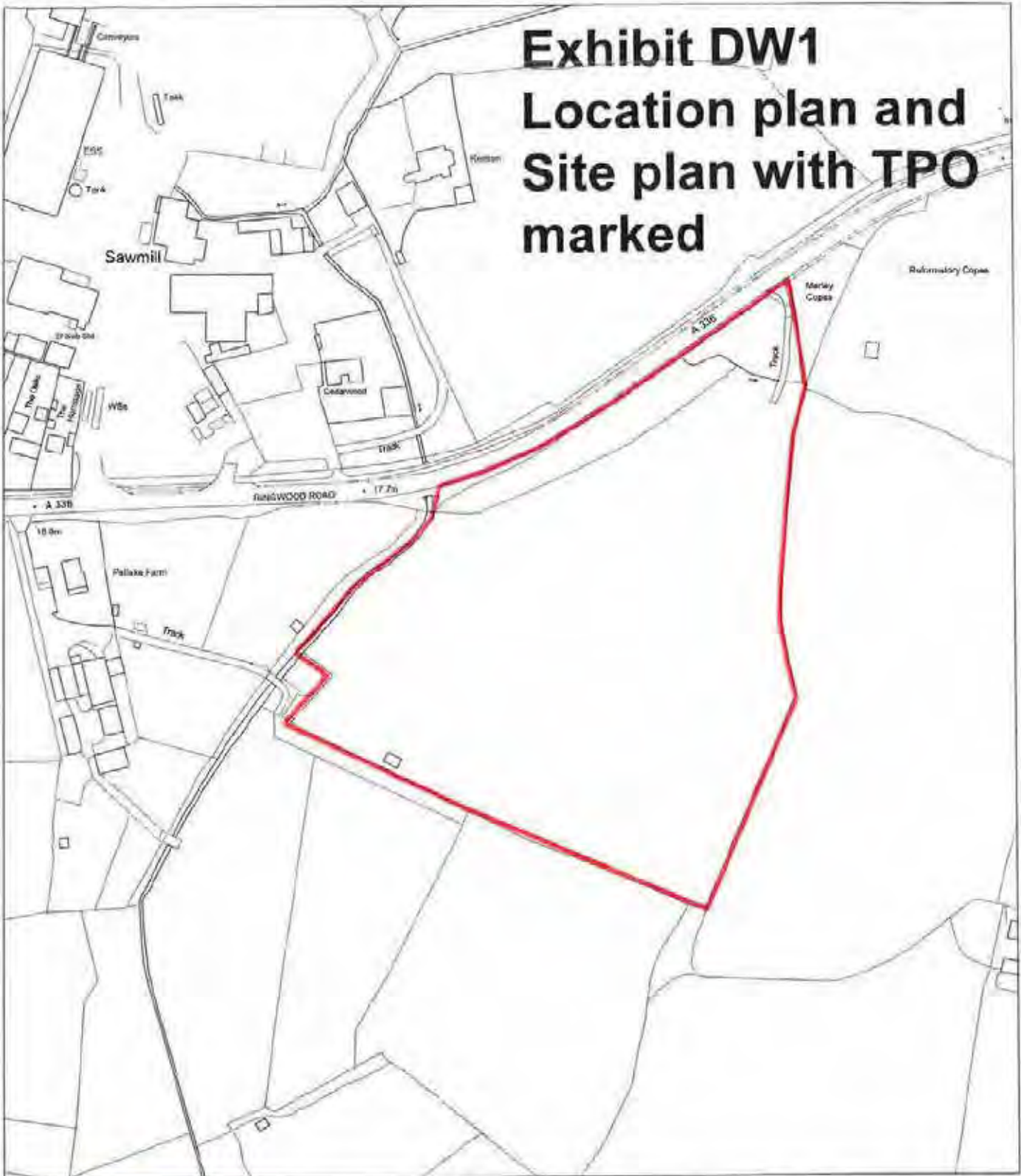
Exhibit DW1 Location plan and Site plan with TPO marked