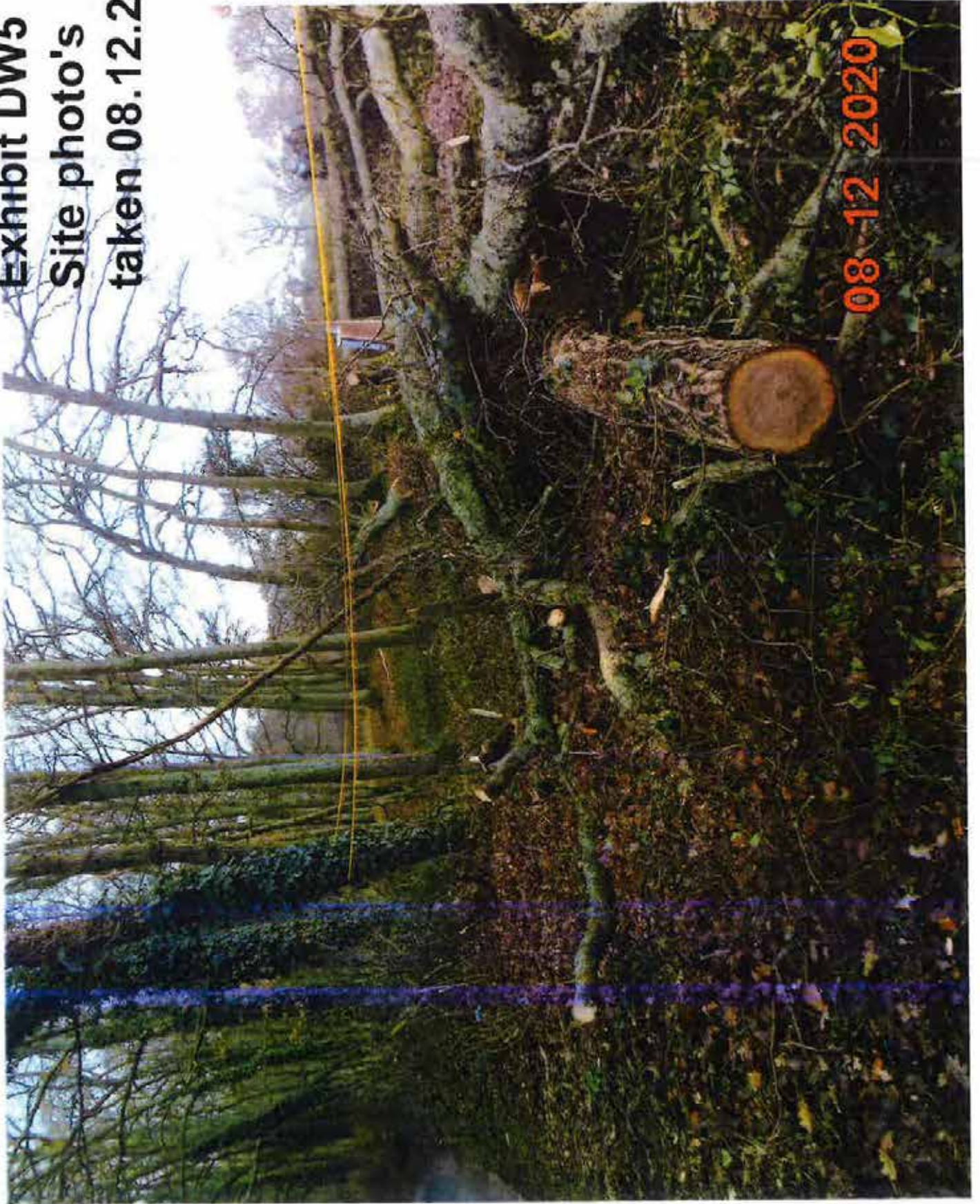
Exhibit DW5 Site photo's taken 08.12.20