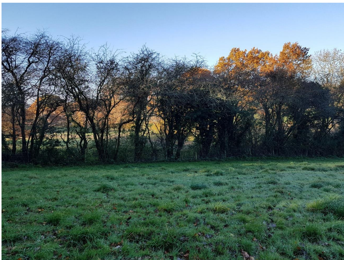
Meadow looking south-west from gate