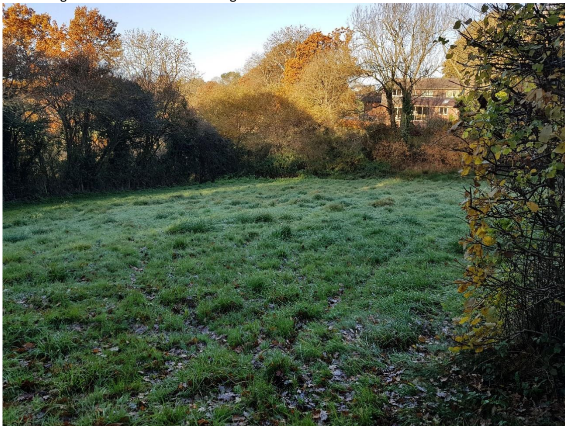
Meadow looking north-west from gate