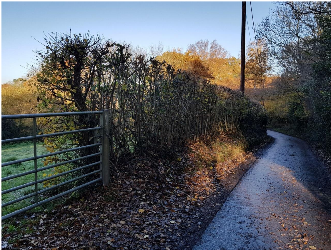
Lane and gate onto meadow with hedgerow