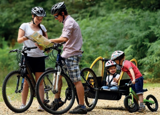
Cycling on Hampton Ridge