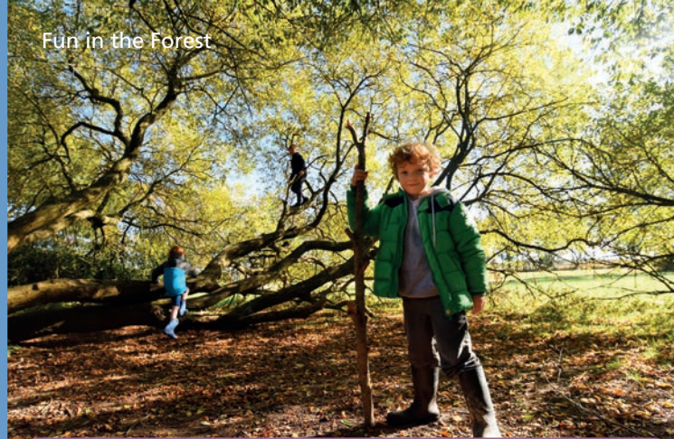
Fun in the Forest

Forest management: Take notice of any warning signs and keep a safe distance from work sites. Only pass a vehicle loading timber when told it is safe to do so.