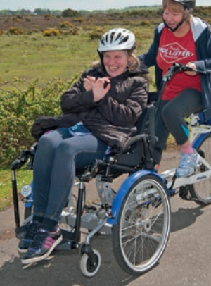
Inclusive cycling at Beaulieu Heath