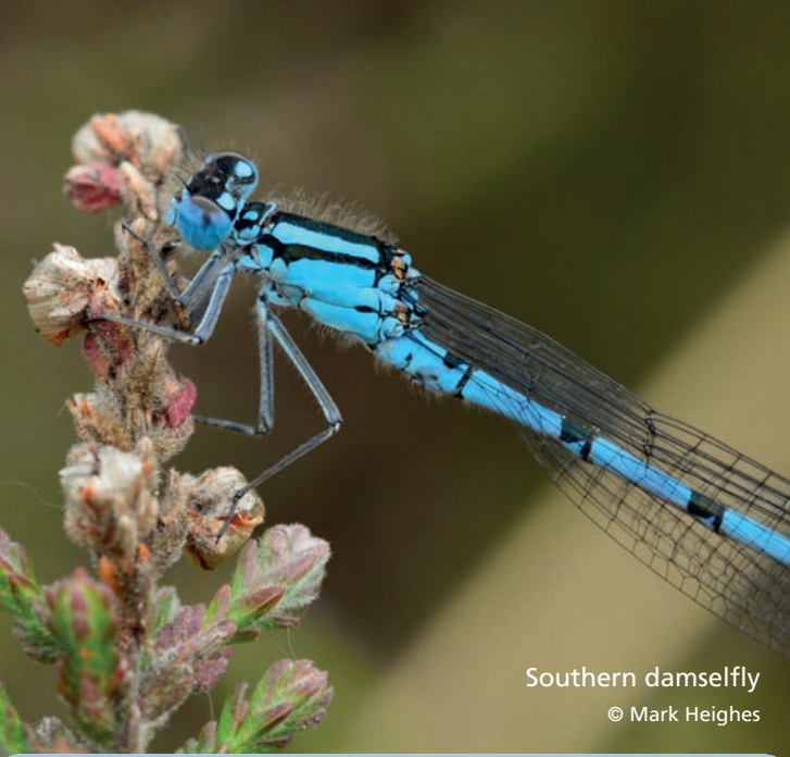
Southern damselfly