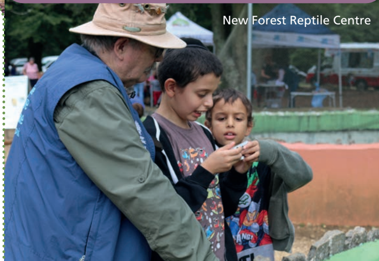
New Forest Reptile Centre

If you want to find out about Forest life and history then visit the New Forest Heritage Centre. Enjoy the changing exhibitions, discover all the best things to see and do and buy unusual New Forest gifts in the shop. newforesterheritage.org.uk