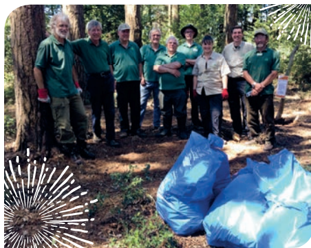
Above: Forestry Commission Rangers and volunteers after successfully clearing six bags of rubbish and dismantling an illegal camp in the Forest