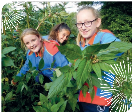
Above: Calmore Guides pulling Himalayan balsam