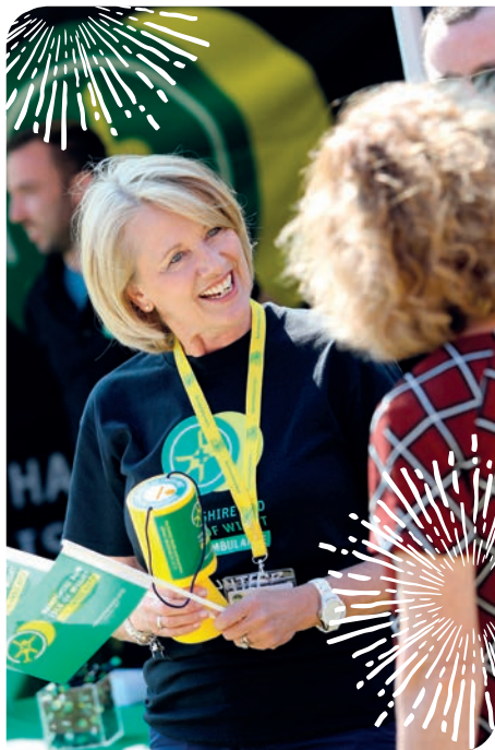
Above: Hampshire and Isle of Wight Air Ambulance