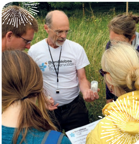
Above: Share your knowledge and volunteer for the Bumblebee Conservation Trust

Left: Volunteers from the Maritime and Coastguard Agency