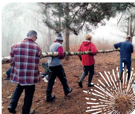
Above: Volunteers help clear sites as part of the Working Woodlands project (New Forest National Park Authority)