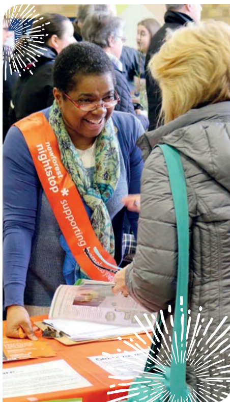
Above: New Forest Nightstop at the volunteer fair