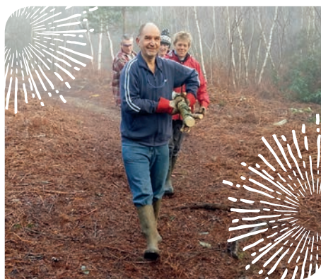
Above: Volunteers enjoying some time outdoors whilst working on the Working Woodlands project