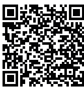
Download for Android