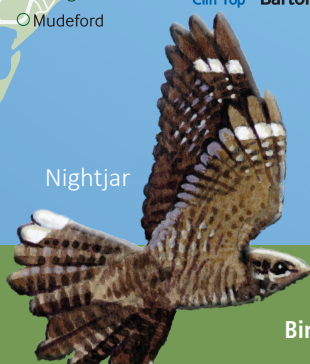
Bird illustrations by Tim Bernhard

Download the New Forest National Park Walks App and discover free walking routes around the beautiful New Forest, devised and tested by National Park rangers: