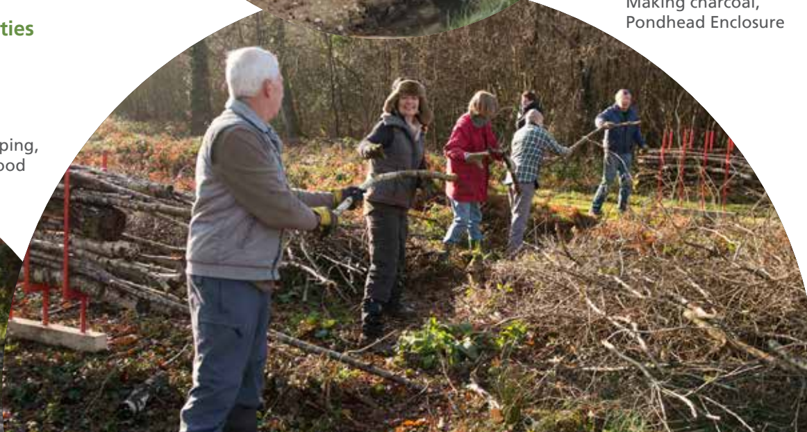
Making charcoal, Pondhead Enclosure