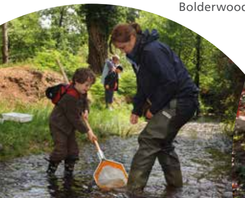
Pond dipping, Bolderwood