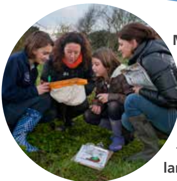
Volunteers undertaking an invertebrate survey

Monitoring will focus on what lessons have been learnt and assess the difference the scheme has made to the heritage and landscape of the New Forest.