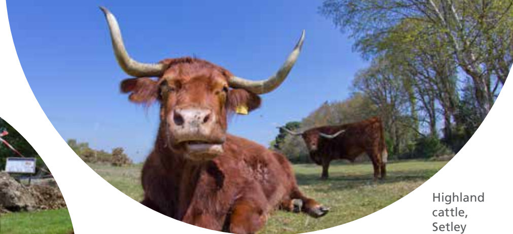
Highland cattle, Setley

The Our Past, Our Future Landscape Partnership: