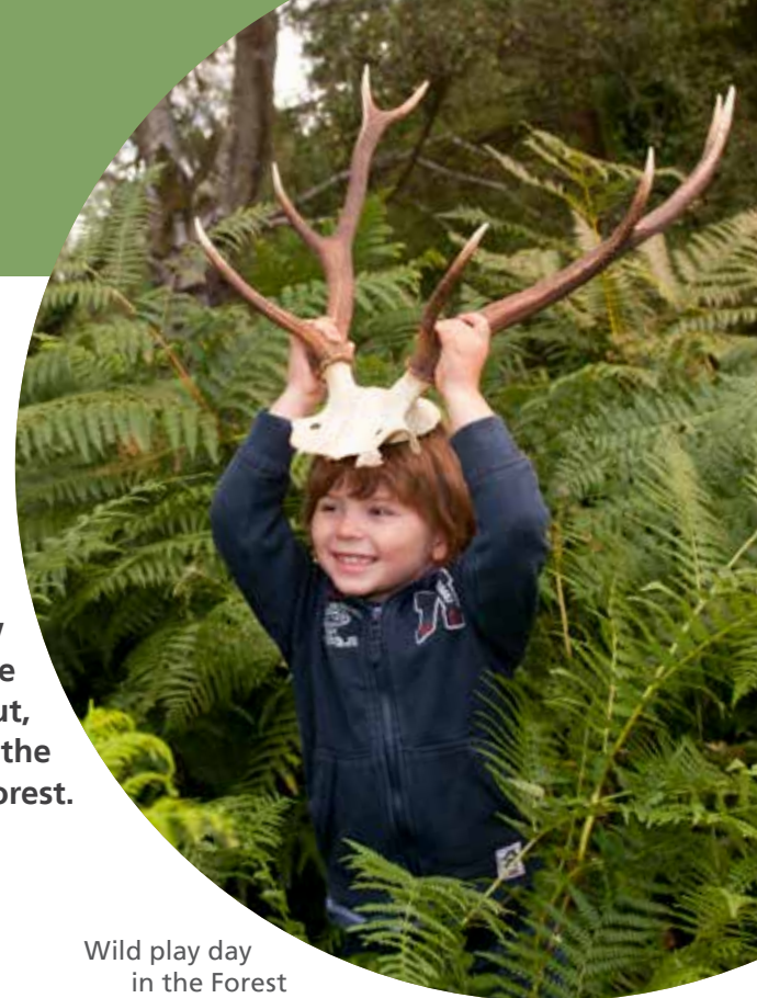
Wild play day in the Forest

Encouraging, enthusing and inspiring a new generation of people to be more involved in learning about, championing and caring for the New Forest.