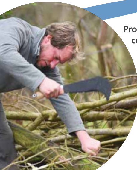
Demonstration of hedge-laying

Providing people and communities with the necessary skills required for the sustainable management of the New Forest habitats and built heritage.