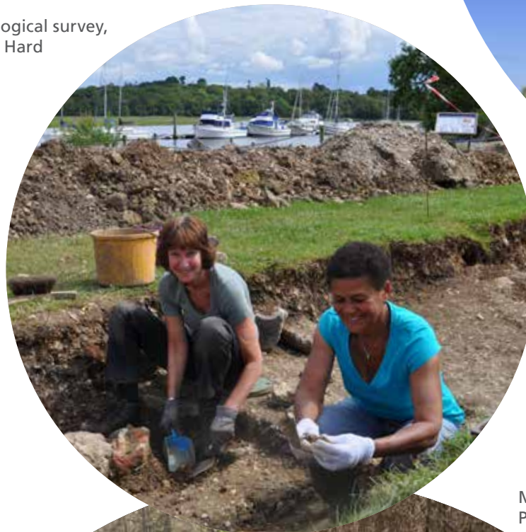
Archaeological survey, Buckler's Hard