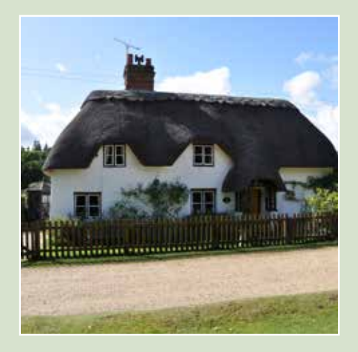
Old Thatch 18th century cottage