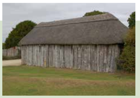
White Cottage barn Woodgreen 18th century 4 bay barn with split trunk walling and thatched roof

At the time of writing there are 621 list entries in the New Forest National Park but additions can be made to the list at any time. In practice this amounts to many more buildings since an entry may include a pair or even a terrace of buildings and many principal buildings have ancillary buildings in their grounds, over which listed building control is exercised. The National Park Authority keeps copies of the statutory lists of buildings for all parishes in the area which are available for inspection. Enquiries about a particular building can be made to the Building Conservation Officer.