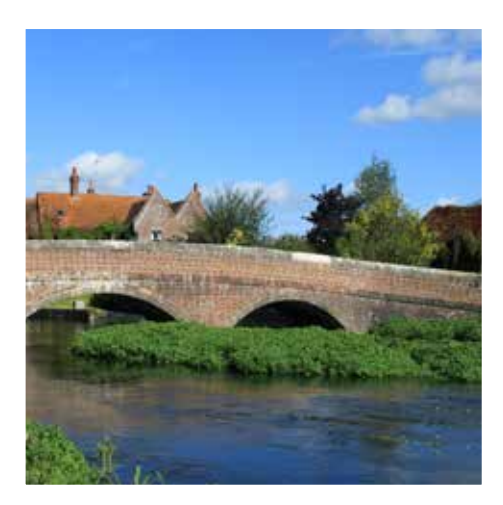
Breamore bridge, mill and millhouse 19th century