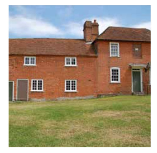
18th century cottages Bucklers Hard

You will also need to submit a Heritage Statement for all applications for Listed Building consent and with applications for planning permission which affect a listed building.