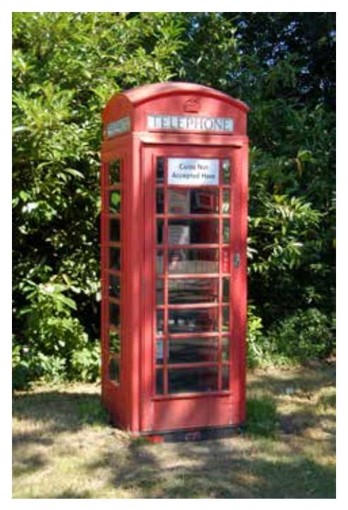
Grade II listed telephone box

building to assist identification. The description has no legal significance and should not be treated as a comprehensive or exclusive record of the features which are considered to make a building worthy of listing.