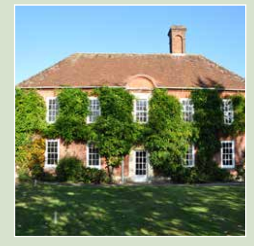
Venard's House, North Gorley 17th century house