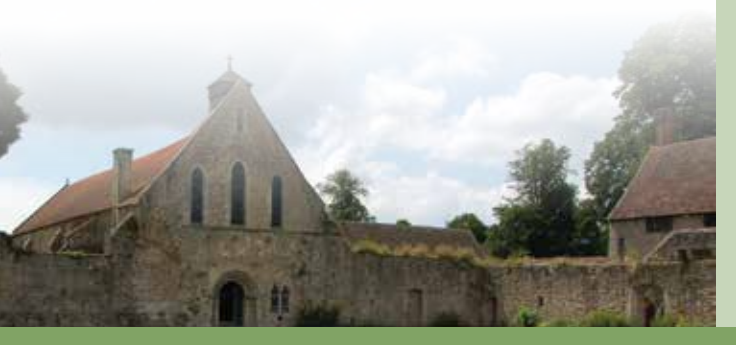
Find out more www.beaulieuchurches.org