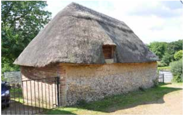
Building of local interest - outbuilding with flint and cob wall under a thatched roof at Godshill.

Consent is not normally granted for the demolition of buildings which make a positive contribution to the character of the conservation area. If you are considering proposals to redevelop a site within the conservation area, conservation area consent will be needed to demolish existing buildings and this should be submitted at the same time as the planning application for any replacement buildings.