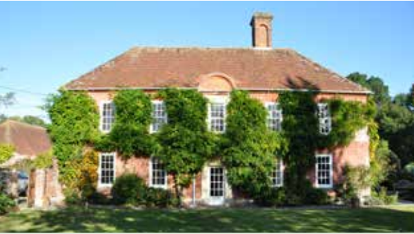
Fine Grade II* late 17th century listed building which was altered in the 18th century.

If a building is listed, additional controls apply to works which affect the appearance or character of both the outside and inside of a property. If in doubt ask for advice before you start work. Legislation is complex and changes from time to time, so contact the National Park’s Building Conservation Officer for up to date advice.