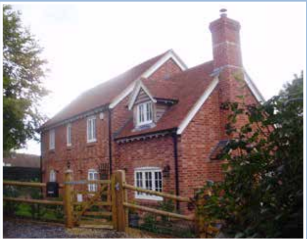
Good example of a new house in the conservation area with traditional detailing and materials.

If you are thinking of submitting a planning application for development in the conservation area, it may be helpful to use a planning agent; and if the proposals are significant, or on a sensitive site, consider appointing an architect familiar with this type of work. Advice on employing an architect can be obtained from the Royal Institute of Architects (contact details on back cover).