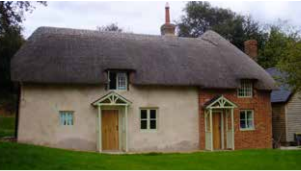
Sympathetically restored cottage with cast iron windows, timber porch and windows remade to match the originals.

Older properties need regular and sympathetic maintenance. Unfortunately ‘restoration’ does not always restore and ‘improvements’ don’t necessarily improve historic buildings. Good restoration is a skilled business. It is very often the accumulation of small changes carried out over a number of years that can end up harming the special character of a building. Construction details and materials are very important, so look carefully at existing buildings in the area for ideas. Removing or replacing parts of a building will reduce its historic value. From the conservation point of view it is always better, where possible, to repair features such as chimneys, doors and windows. If replacement is the only option, use the existing feature as a pattern.