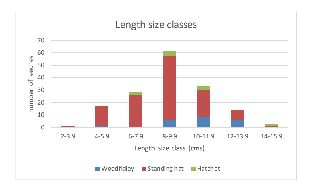
Figure 1. Distribution of leeches in length size classes