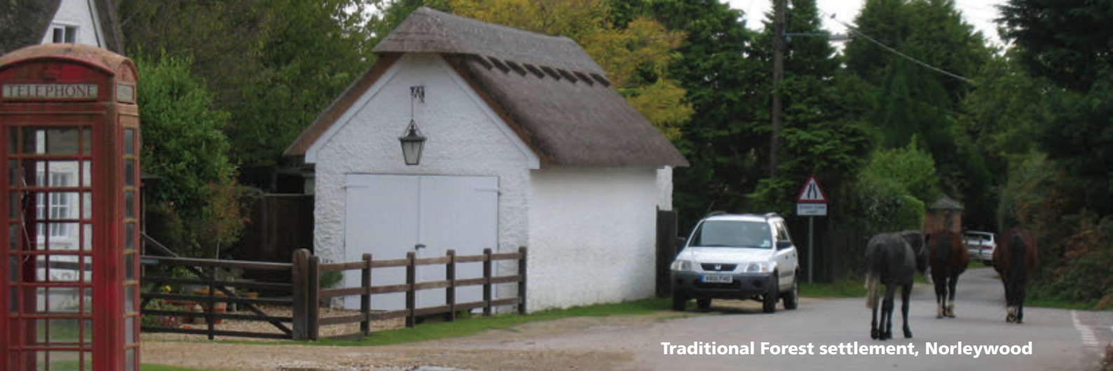
Traditional Forest settlement, Norleywood