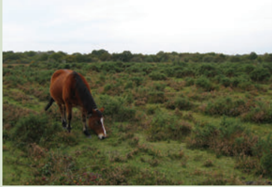
Pony grazing, Beaulieu Heath