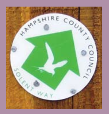
Solent Way sign

Public access can be either linear or area-wide.