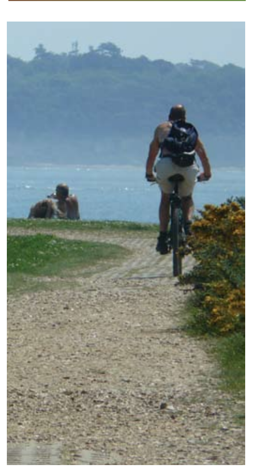
Cycling at Keyhaven

One of the methods for achieving this aim is through a National Park behavioural code entitled 'Caring for the New Forest'. This code provides advice for local residents and visitors to ensure that their visit has a positive impact on the Park and contributes to preserving the Forest for future generations to enjoy. The code of behaviour was agreed between the New Forest National Park Authority, New Forest District Council and the Forestry Commission and is available on the National Park Authority website.