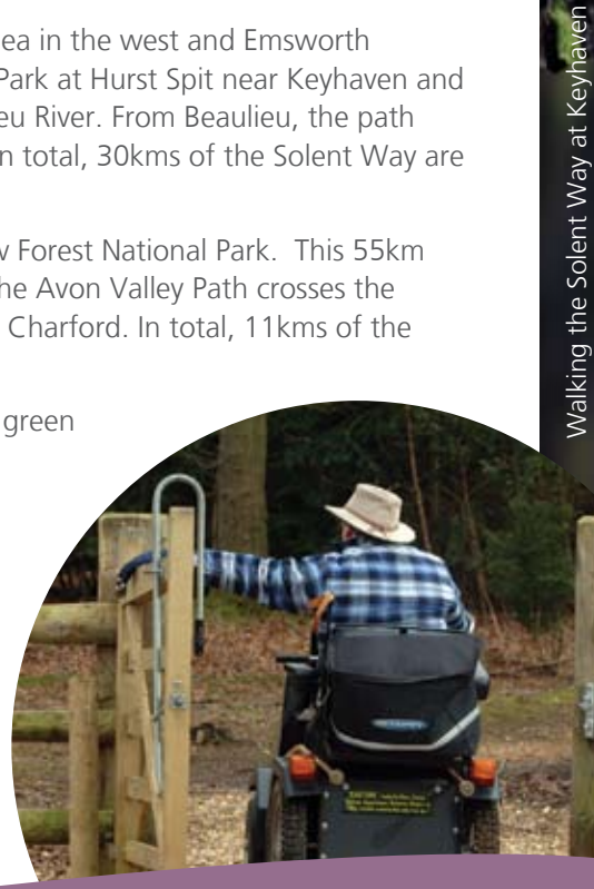
Access through gate at Wilverley Inclosure

The Authority is working with land owners and managers to install accessible gates and to improve path surfacing on some routes to enable people of all abilities to enjoy the Park. The Authority will also be producing detailed accessibility information about many sites and areas which will help people to decide which sites are suitable for them to visit.