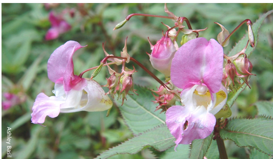
Himalayan Balsam on the Lymington River