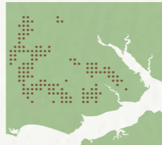
New Forest heathland breeding records 1994