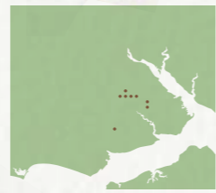
New Forest heathland breeding records 2004