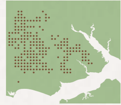
New Forest woodland and heathland breeding records 2004