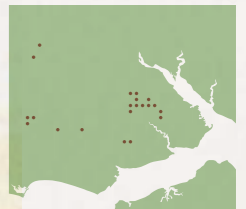
New Forest heathland breeding records 2004