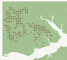
New Forest woodland and heathland breeding records 1997 and 2006

Amber list: Medium conservation priority