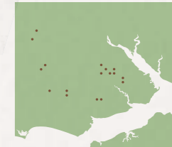
New Forest heathland breeding records 2004

... 'tis my familiar sin, With maids to seem the lapwing, and to jest, Tongue far from heart.'