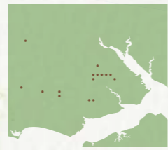
New Forest heathland breeding records 2004