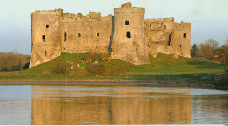
Carew Castle, Pembrokeshire Coast National Park

The United Kingdom's National Parks are amongst its finest and most treasured landscapes, rightly recognised for their tranquillity, special wildlife and unique habitats. They are also cultural landscapes, shaped by human activity over thousands of years. These living, working landscapes have, in turn, influenced local and national identity, inspiring writers, poets and artists and contributing significantly to the nation's rich cultural legacy.