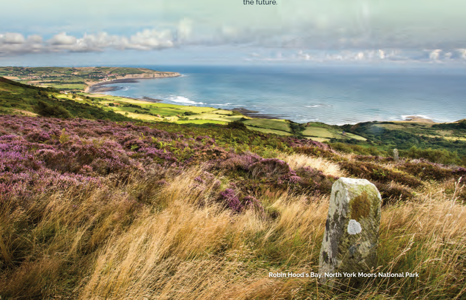
Robin Hood's Bay, North York Moors National Park

National Parks are incredibly special places. Their heritage is a national asset recognised the world over. Understanding, conserving and communicating the stories of these cultural landscapes is integral to protecting them, allowing us to realise their potential and, by so doing, enriching the lives of all of those who live in, work in or visit National Parks today and in the future.