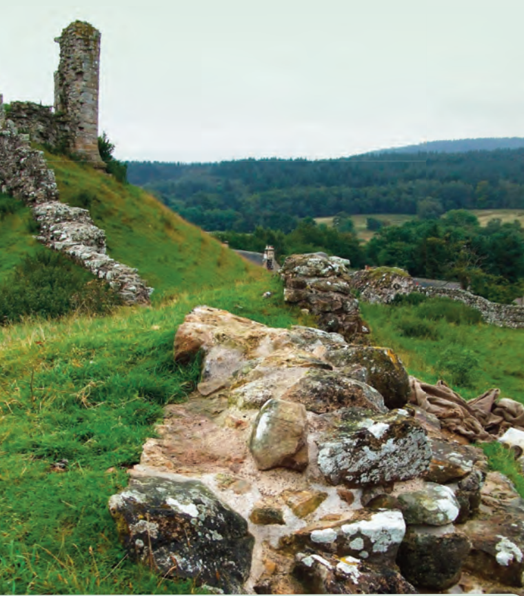
Harbottle Castle, Northumberland National Park