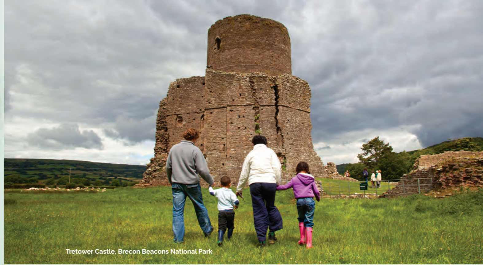
Tretower Castle, Brecon Beacons National Park