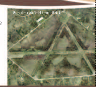
Beaulieu airfield from the air

The Forest at war ▶ During the Second World War the New Forest became an important training and staging area, with numerous airfields and ranges. It was closely involved in the build up for the invasion of Europe.