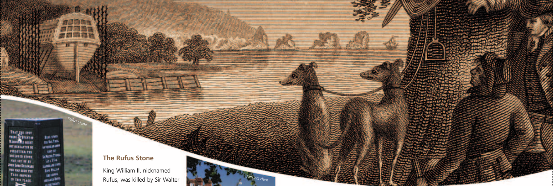
Engraving from Percival Lewis' 'Laws and History of the New Forest' (1811)