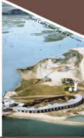
Hurst Castle from the air

Coastal Castles ▶ Hurst Castle and Calshot Castle overlooking the Solent tell the story of 500 years of defence of the realm. They were built for Henry VIII and have been fortified many times since.