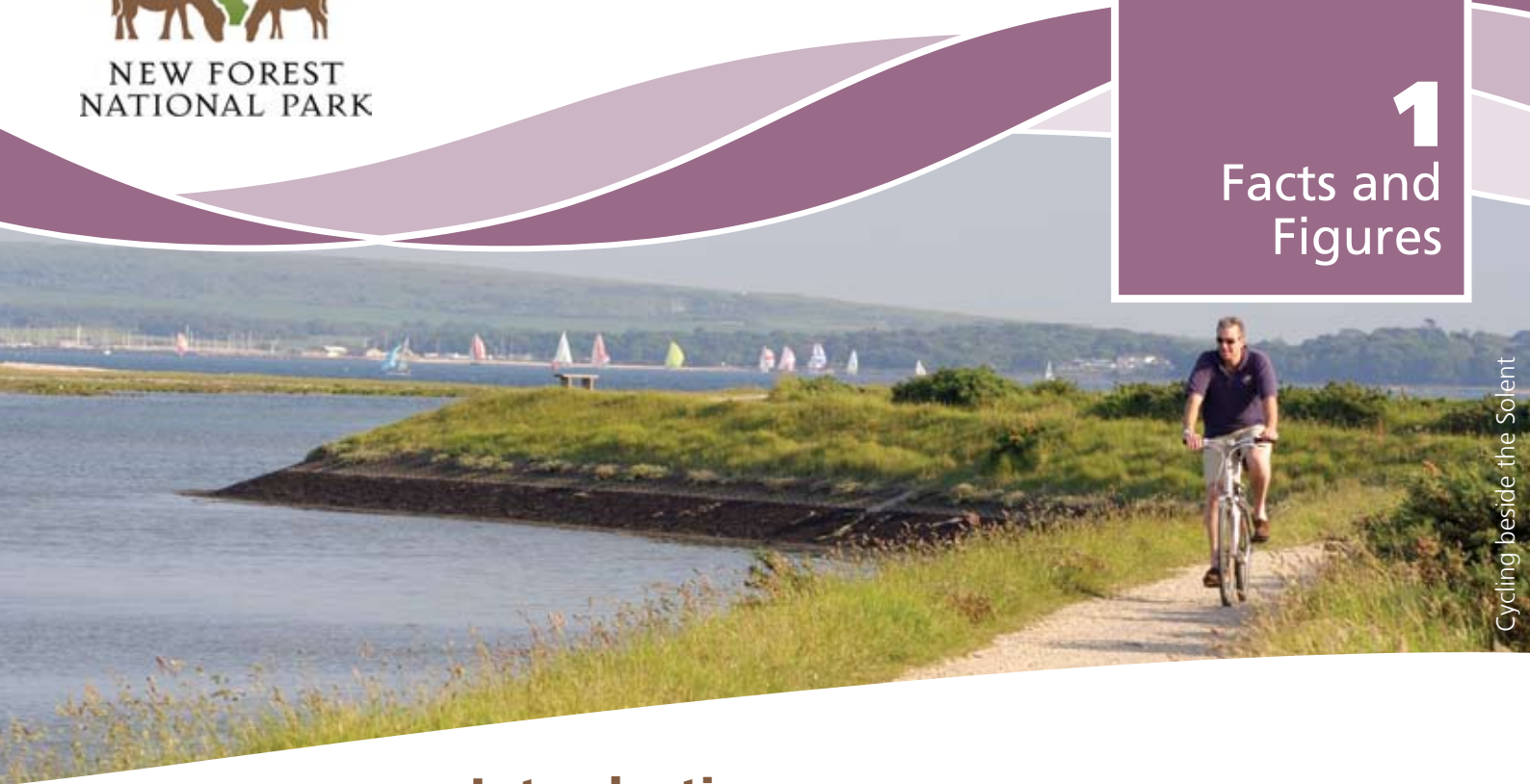
Cycling beside the Solent