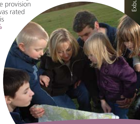
Family with map

Of those who felt able to comment, around half ( 46% ) felt that the provision of information for disabled visitors at that site was 'good' or 'very good'. 29% described this as 'average' and 25% as 'poor' or 'very poor'. The provision of facilities for disabled visitors was rated more highly. 59% considered this to be 'good' or 'very good', 22% 'average' and 19% 'poor' or 'very poor'.