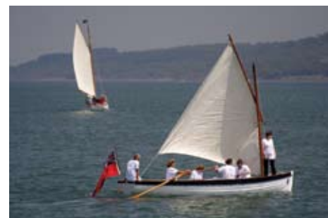
Gaffers race in the Solent