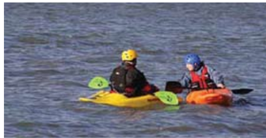
Canoeists at Calshot Activities Centre

Local facilities and services including car parks, toilets, paths and information boards were widely used by visitors. Car parks ( 83% ), toilets ( 31% ) and local shops ( 31% ) were the facilities most frequently used by visitors. 16% used local pubs or inns and 15% used local cafes or tea-rooms during their visits. Waymarked footpaths were used by 34% of all visitors, while smaller proportions used waymarked cycle paths ( 11% ) or bridleways ( 9% ). 10% used information boards and 6% used picnic sites.