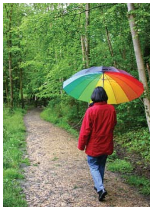
Walking at Manor Wood

The following facts and figures come from a result of a number of surveys carried out by Tourism South East Research Services, September 2005.