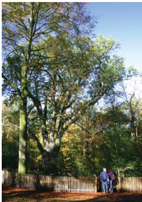
Visitors admiring the Knightwood Oak