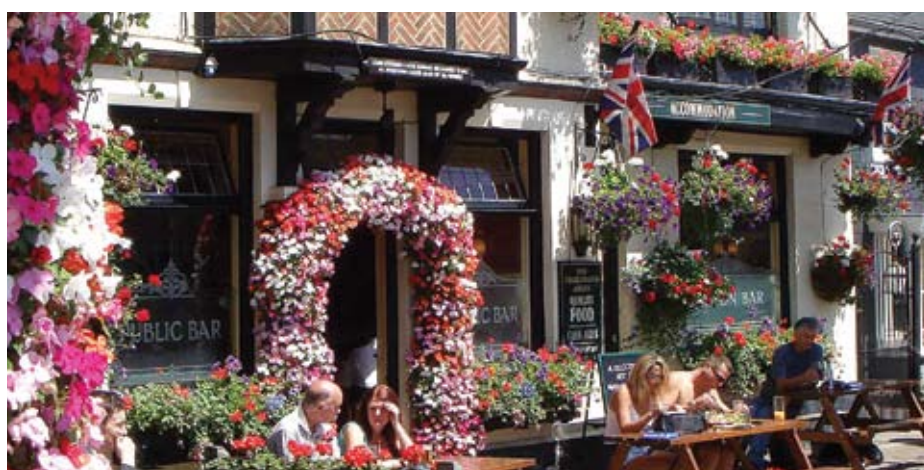
Public house in Lyndhurst

Other recreational activities that can be found in the forest include cycling, horse-riding, kayaking, sailing, and fishing.